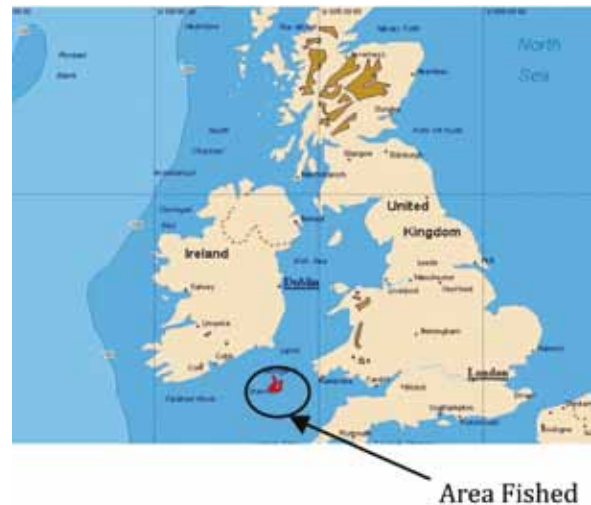
Figure 2. Smalls Fishing Grounds