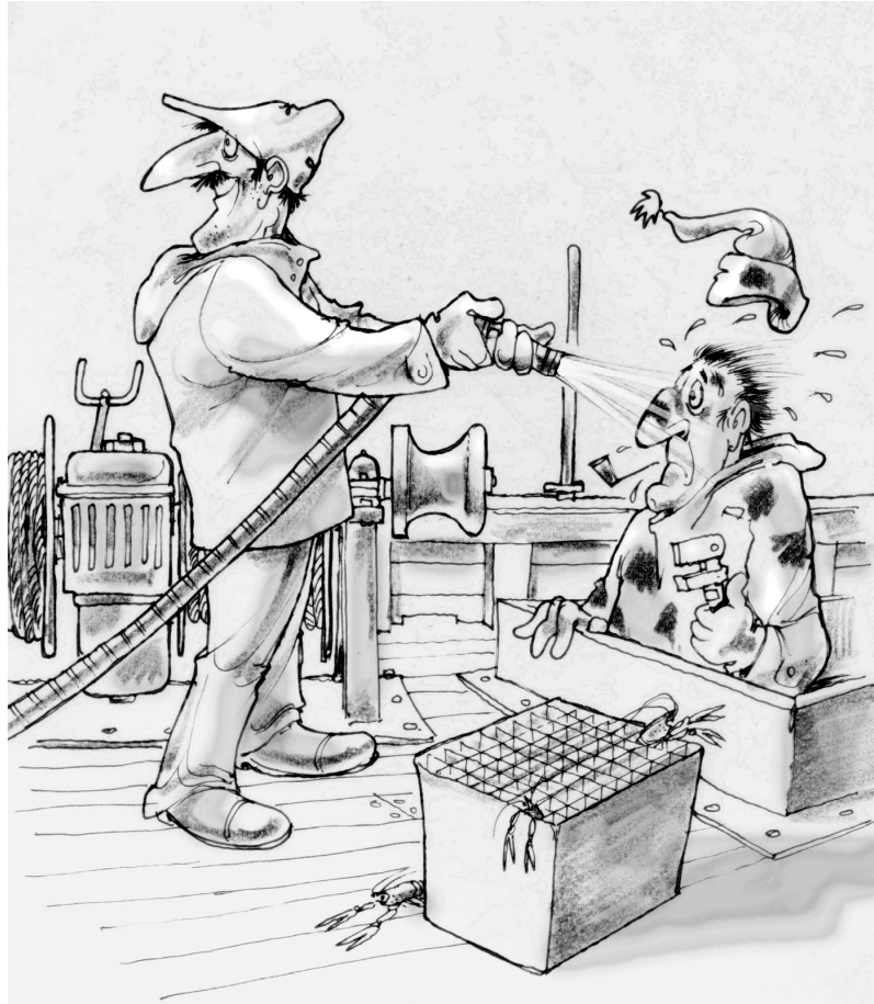
Figure 1 - Hoses should reach all areas that require cleaning and have sufficient pressure for effective wash-down