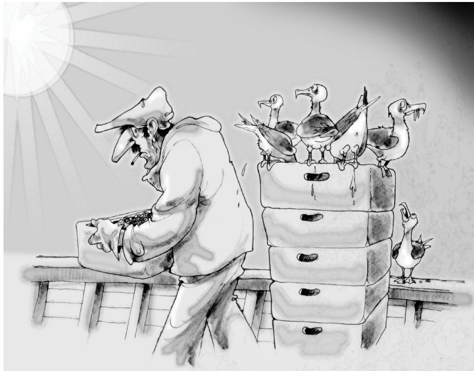
Figure 3 - Boxed Nephrops and fish must be protected from the elements and sources of contamination at all times