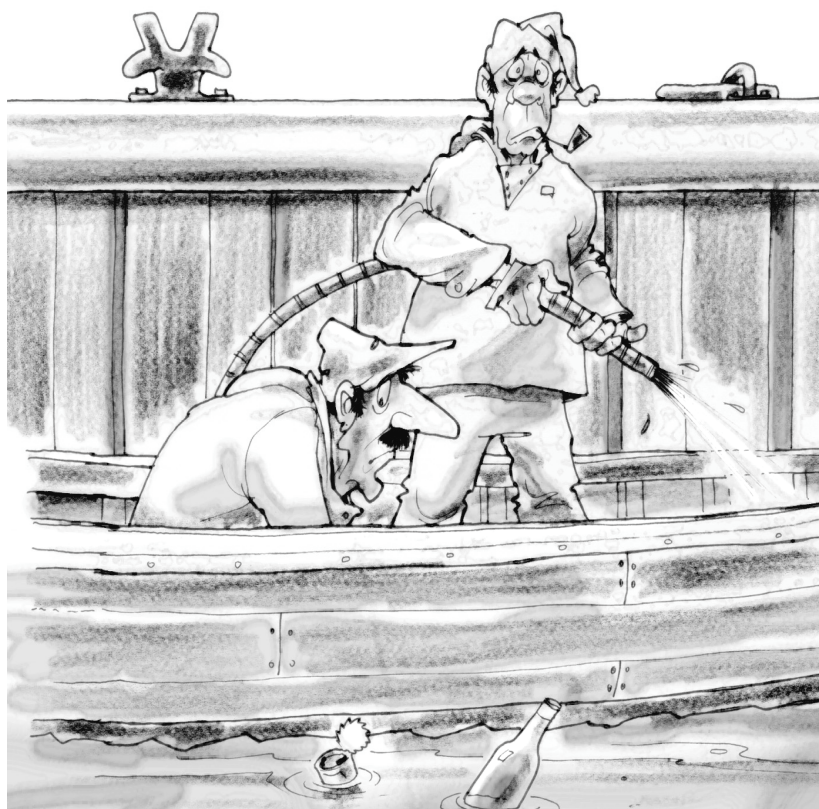
Figure 2- Dock water is not suitable for wash down purposes