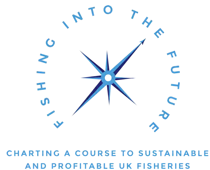
FISHING INTO THE FUTURE